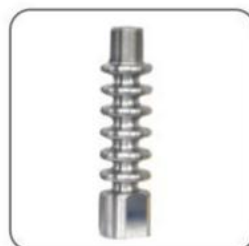
R3 High-Temperature tube