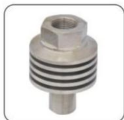
R1 High pressure radiator