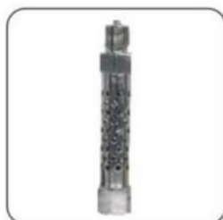
R2 Capillary radiator