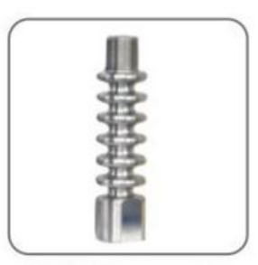
R3 High-Temprature tube