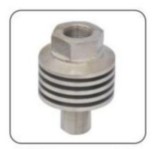
R1 High pressure radiator