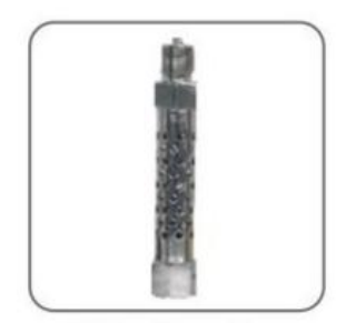
R2 Capillary radiator