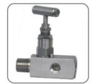
One Valves With A Bleeding Screw